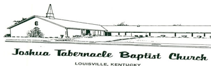
Joshua Tabernacle Baptist Church LOUISVILLE, KENTUCKY

Saturday, September 7th, 11:00AM , When Men Meet.